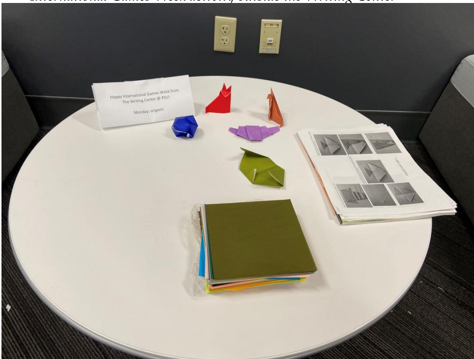
Figure 3 International Games Week activity outside the Writing Center

Many playful activities were portable. Therefore, some were moved to other areas by patrons, mainly to the seating area near Axe Grind.