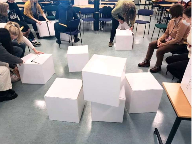
Figures 4 and 5. The 'wonder' of the creatively enhanced cardboard cubes, in small scale (left) and large scale (right).