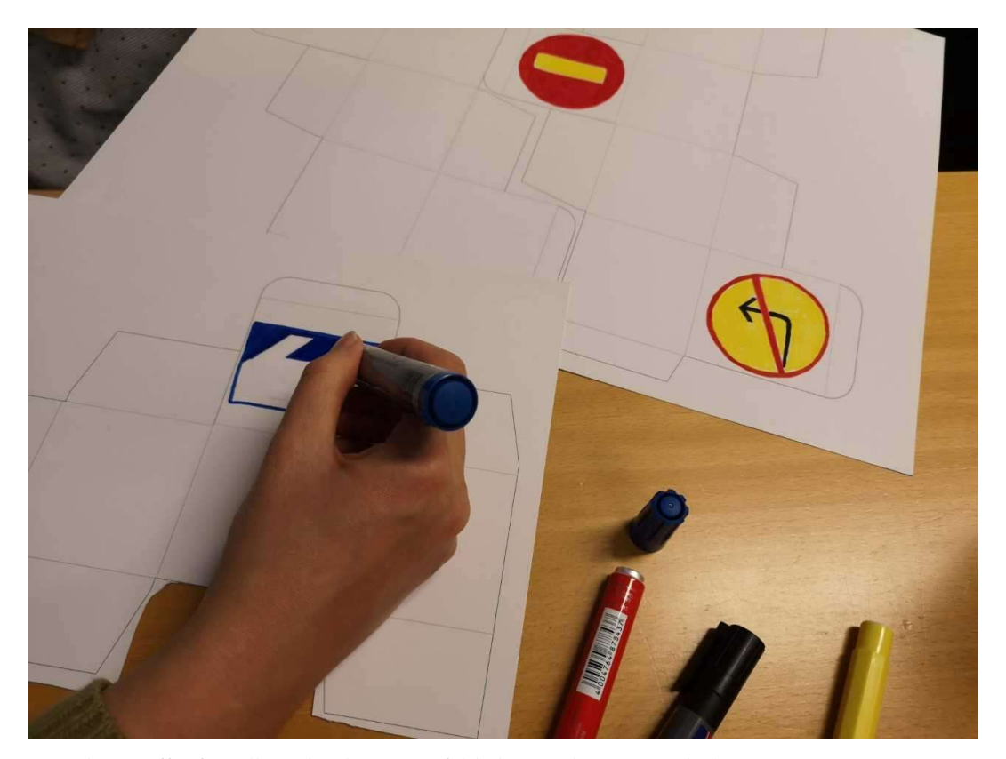
Figure 2. The 'stuff' of cardboard cubes in unfolded, two-dimensional shape.

In this way, not only the number and volume, but also the size of 'stuff' matters, as our bodies interact differently in terms of physical movement in space with three-dimensional tools of different sizes.