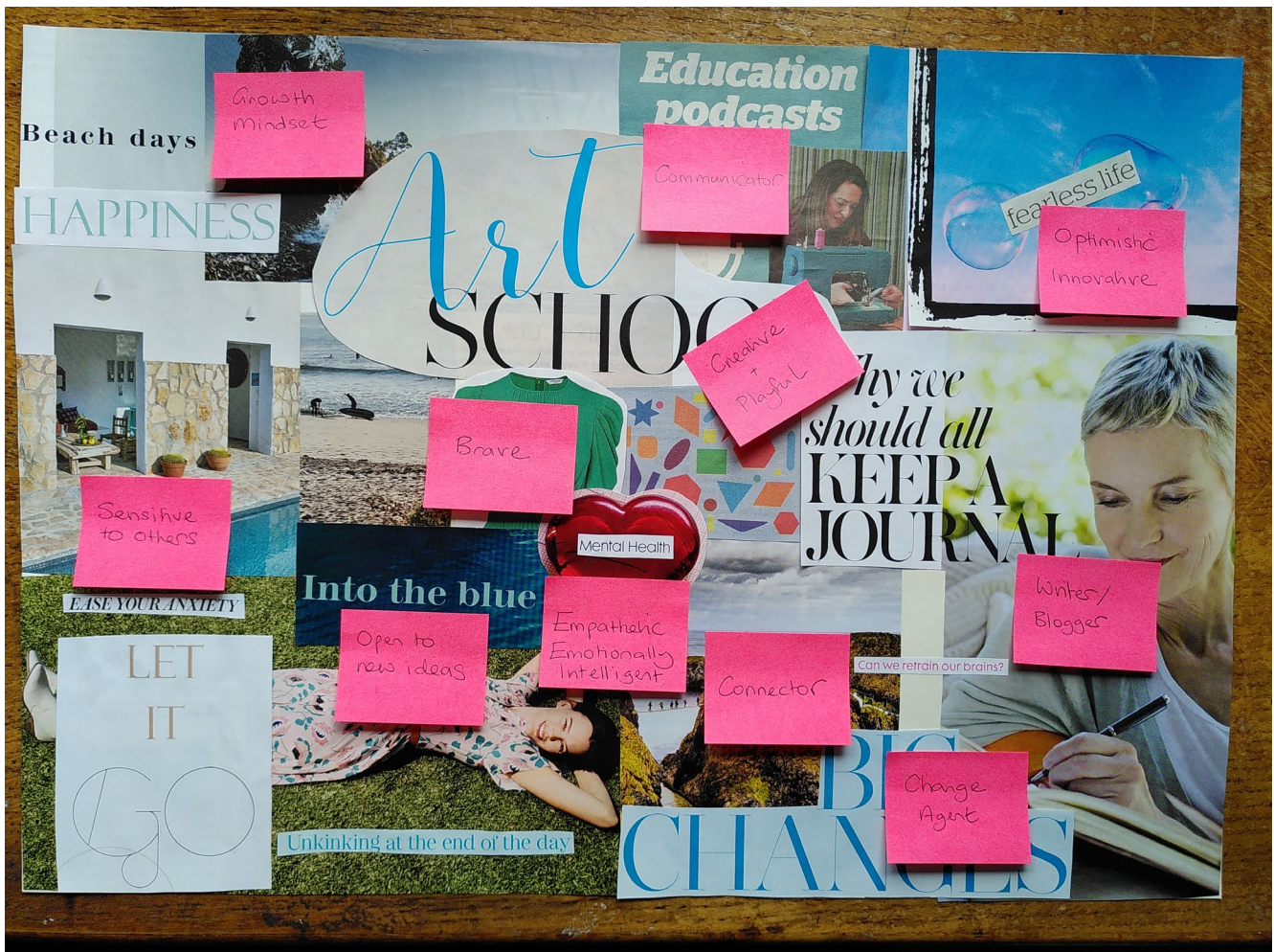
Fig 2 Collage