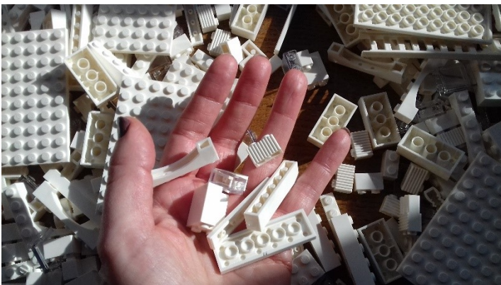
Fig 3 Mindful LEGO®

If you are happy to, please share any thoughts, reflections and suggestions that have bubbled up during the activity on a thought bubble card/post-it note and hang on a tree/add to a whiteboard.