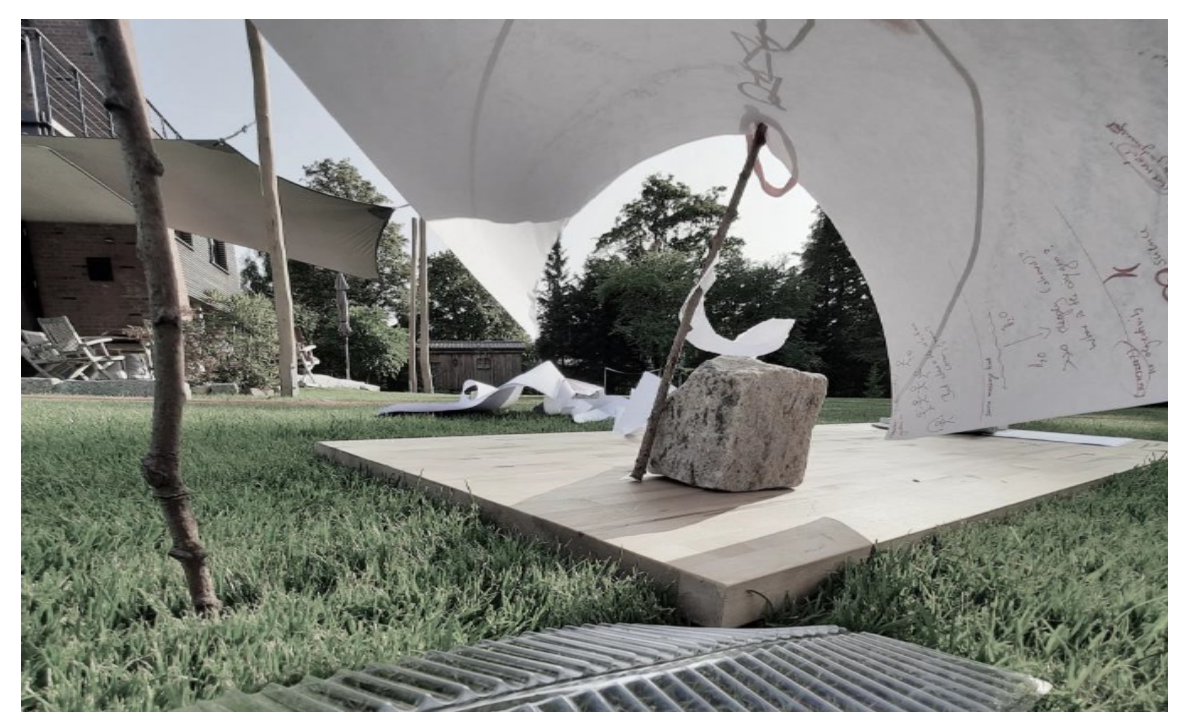
Figure 3S : A perspective shot through Activity 4 – this time triangulating space within a 3x4m area of lawn and additional materials found in the garden, rather than paper and pens only.