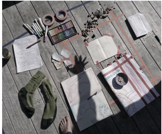
Figure 2S: Materials and traces from Activities 1 to 4. AL exploring with two colleagues in Hamburg.

When everybody has had time to share, check in with the group if there is any interest in sharing more. You might also do 'another round' of time to share for each person.