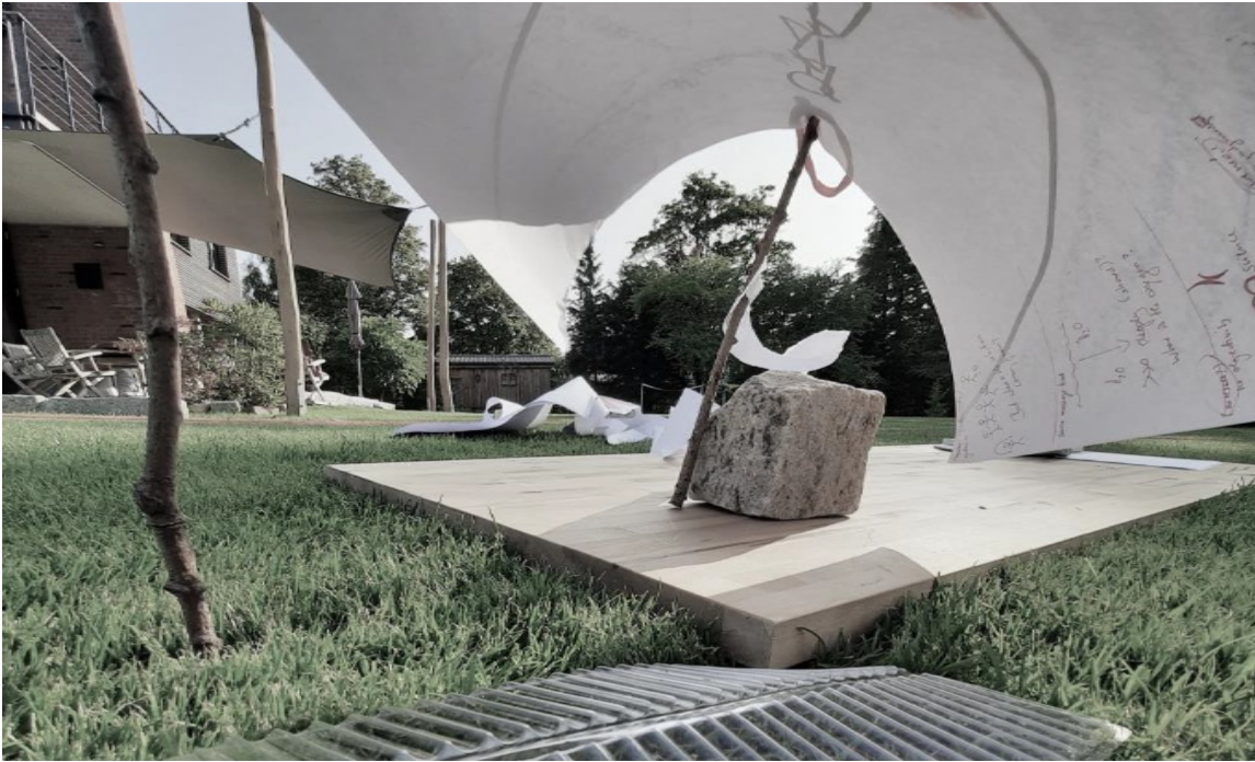
Figure 3S: A perspective shot through Activity 4 – this time triangulating space within a 3x4m area of lawn and additional materials found in the garden, rather than paper and pens only.